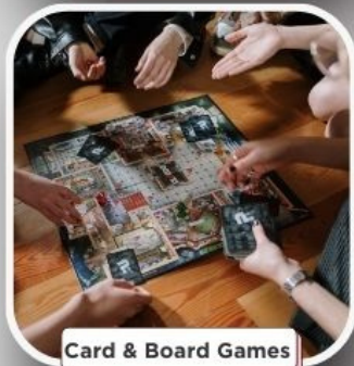
Card & Board Games