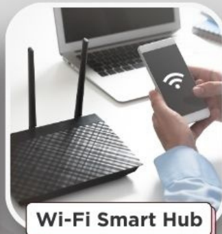
Wi-Fi Smart Hub